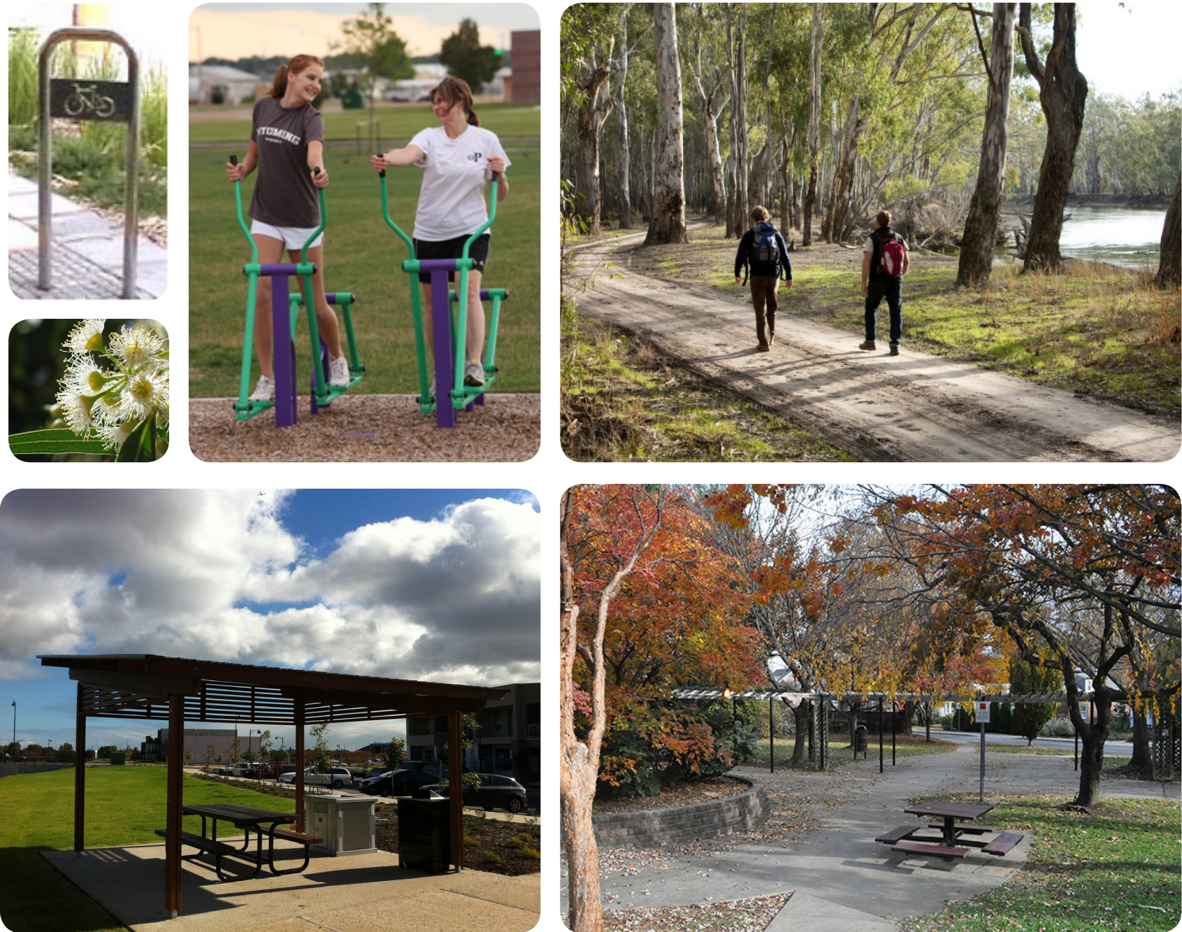
Example images of new improvements to Old Talunga Park

Formalise car parking on the Site to make it safer and more functional. This may include compacted gravel surfacing, wheel-stops and bollards.