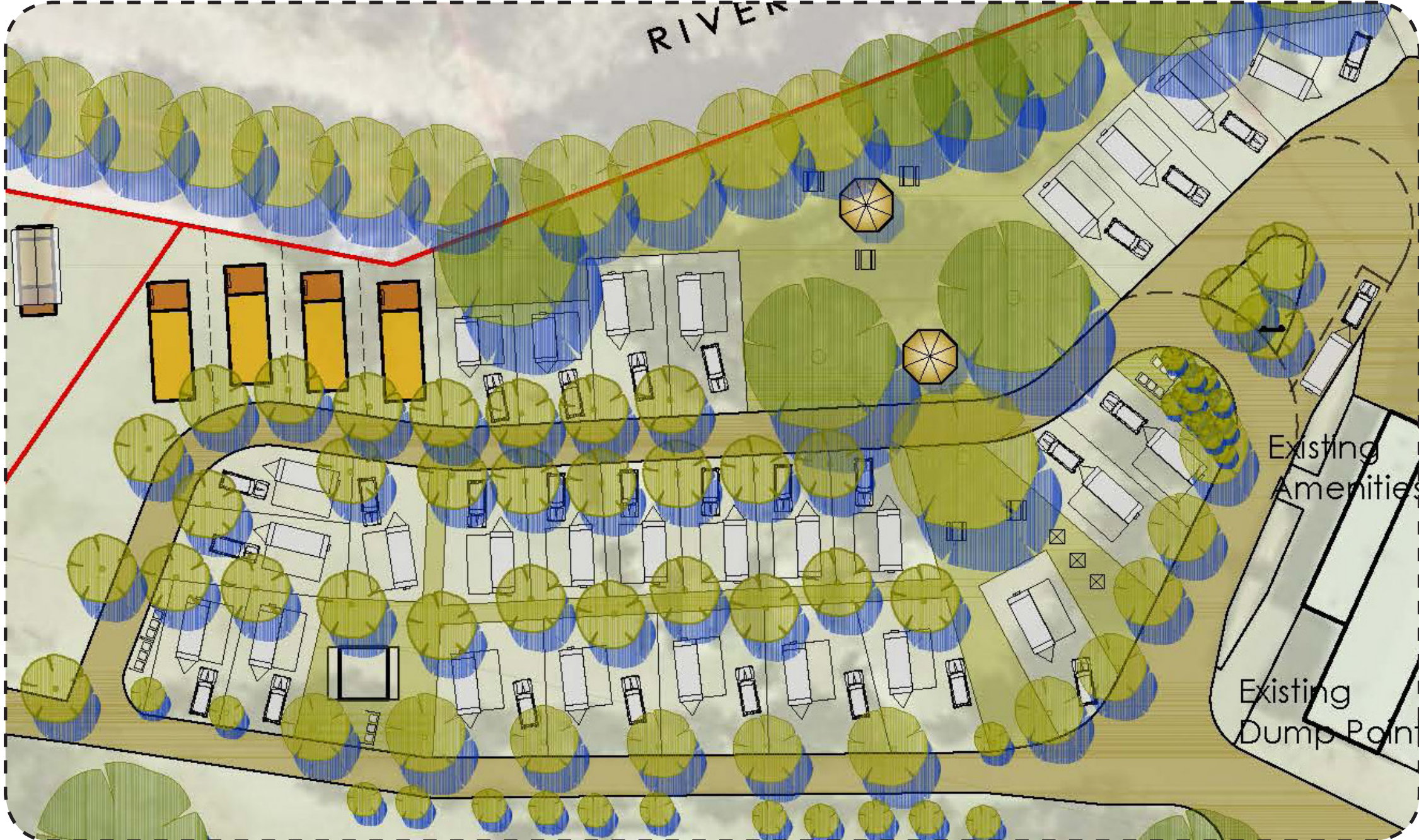
PROPOSED NEW TALUNGA PARK CARAVAN AND CAMPING PARK LAYOUT

The Overall Vision was developed in consultation with multiple stakeholder and community groups and captures the essence of the Talunga Park Masterplan.