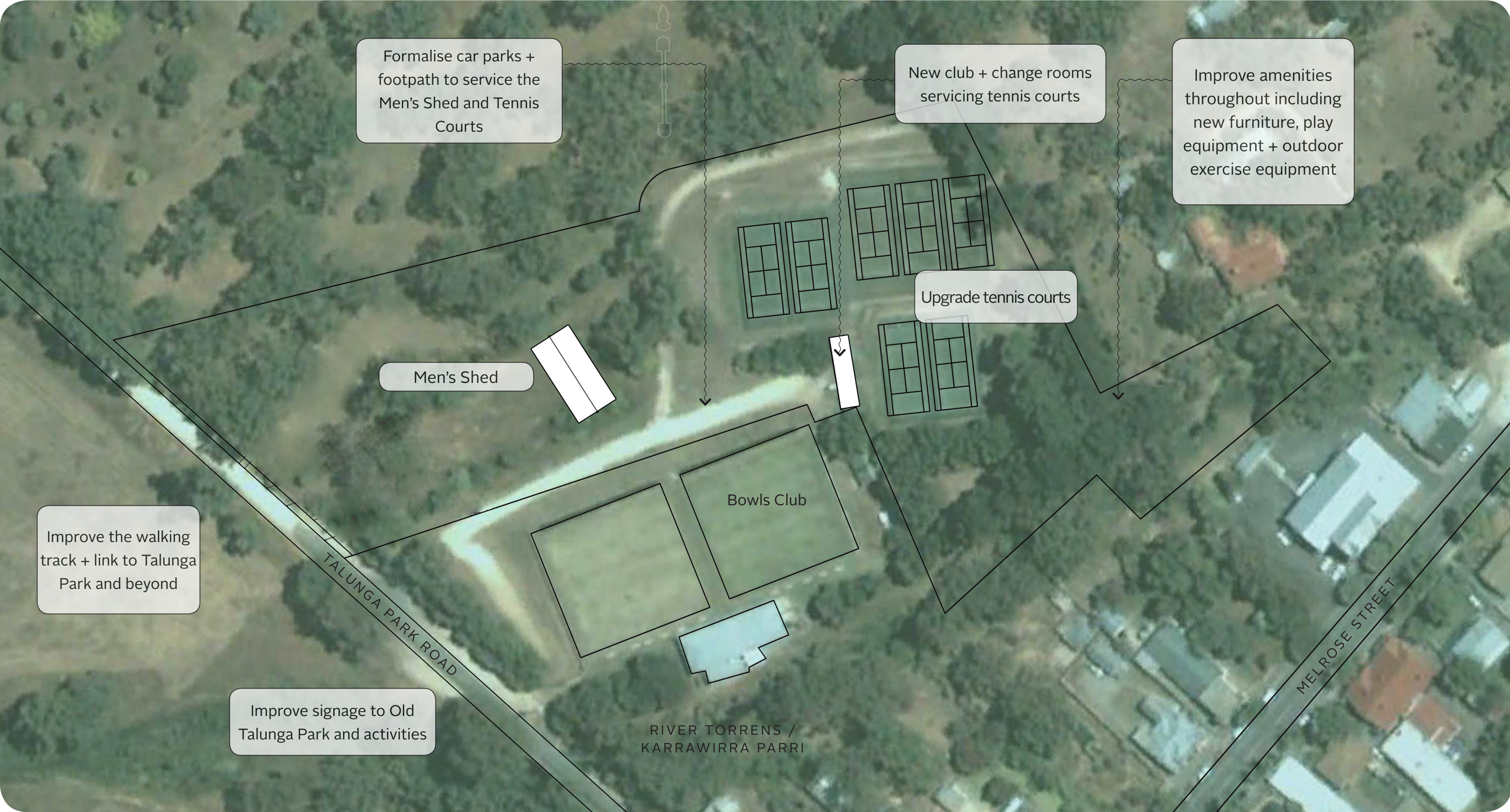
Old Talunga Park

The park setting, adjacent to the upper reaches of the River Torrens, reminds us of the importance of using natural resources wisely. The park uses recycled water, and solar energy to generate some of its power.